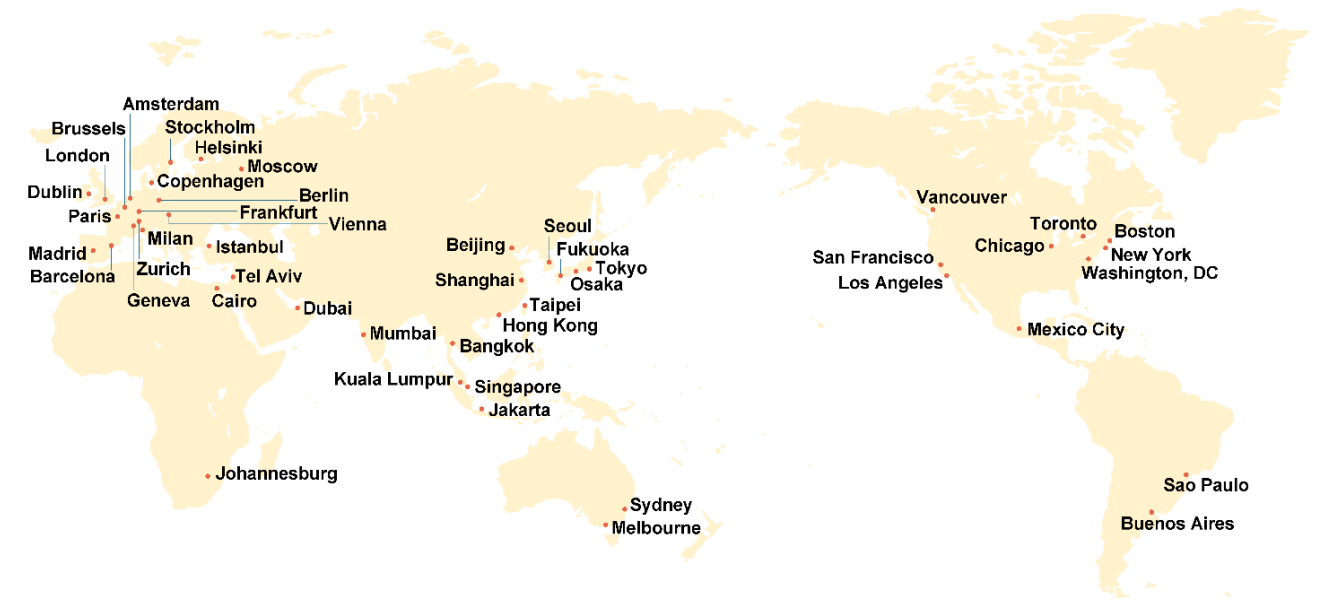
48 of the world's major cities as ranked by Mori Memorial Foundation's GPCI 2019 Report

Tokyo, November 19, 2019 — London, New York, Tokyo and Paris were again named the world's most comprehensively attractive cities, in that order, in the Global Power City Index (GPCI) 2019 report published by The Mori Memorial Foundation's Institute for Urban Strategies, a research body established by Mori Building, a leading urban developer in Tokyo. Since 2008, the annual GPCI report has been ranking 40 or more major cities in terms of "magnetism," or overall power to attract creative individuals and enterprises from around the world. Cities are rated in terms of 70 indicators in six categories (functions): Economy, R&D, Cultural Interaction, Livability, Environment and Accessibility. In an effort to deal with changes in the conditions surrounding global cities, the GPCI is continuously improving its indicators and data-collection methods. In GPCI 2019, indicators such as "Tourist Attractions," "Nightlife Options," "Variety of Workplace Options" and "Public Transportation Use" were added. Four cities—Melbourne, Helsinki, Dublin and Tel Aviv—were newly added due to their strengths in business and livability.